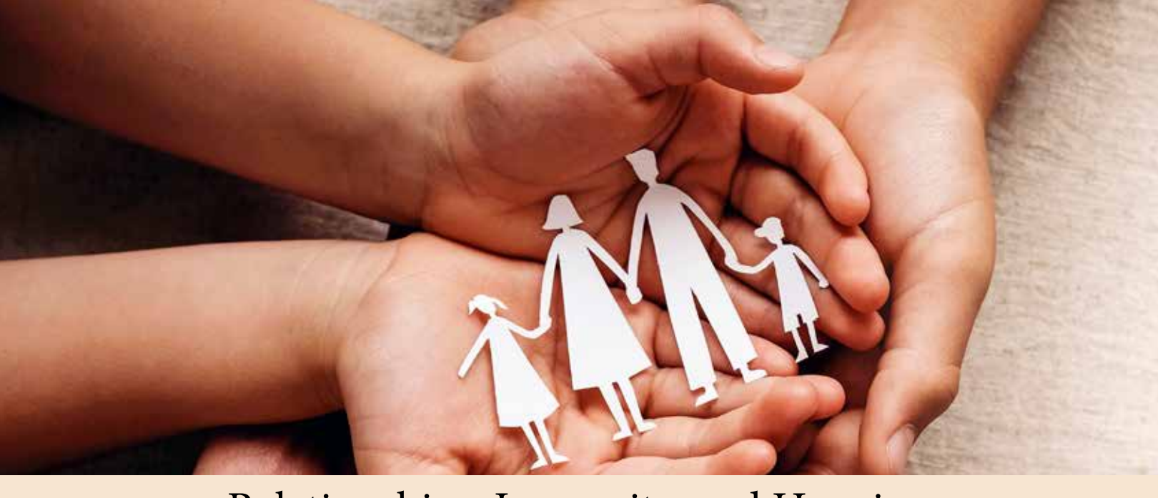
Relationships, Longevity, and Happiness

Ithough not an official holiday, the third Monday in February has been declared by five provinces in Canada an annual holiday to celebrate the family. It is known as Family Day. If not relationships, what is family?