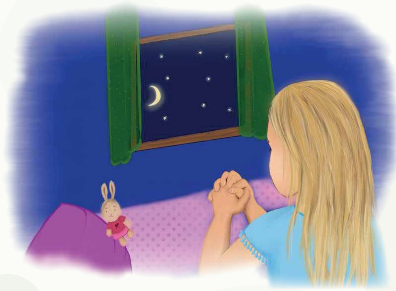
"But as many as received Him, to them He gave the right to become children of God, to those who believe in His name." (John 1: 12)